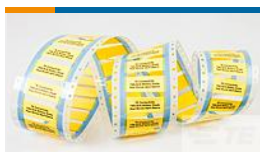
TE Part #3880430001 TMS-SCE-1K-1-1/2-2-0-4