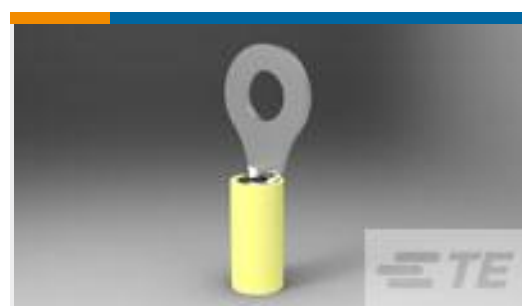
TE Part #165028 PIDG RING 12-10 6MM