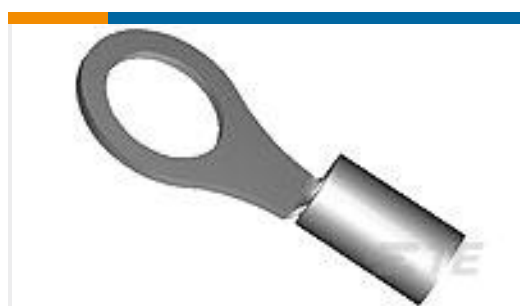
TE Part #323219 SOLIS R HR 22-16COM22-18MIL 6