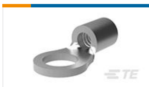
TE Part #2-34114-2 TERM, SOLIS, R, 22-16, 5/16