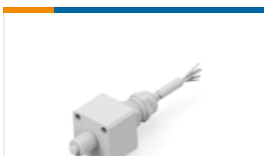
TE Part #K1162519 Limit switch G12-221-O-15 931