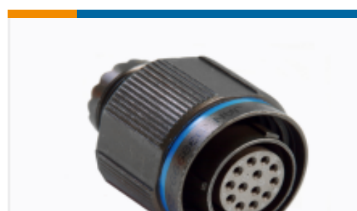
TE Part #ZPF00000000016911 DTS 26 F 11-35 SN