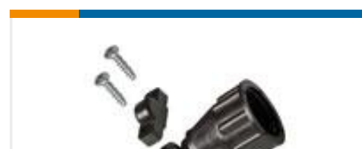
TE Part #1-206062-4 CABLE CLAMP KIT #11