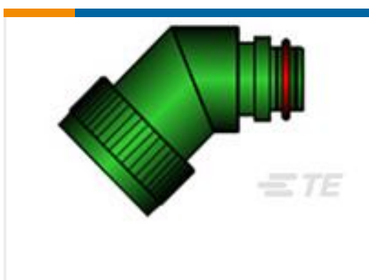
TE Part #CM9965-000 TXR40AC45-1812BI