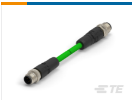
TE Part #TAD14747101-002 M12D4-MS-MS-FRNC TYPE B GREEN-1.0M