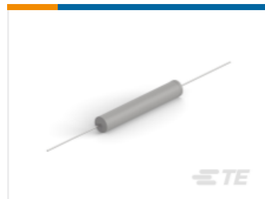
TE Part #4-2176416-5 9W STD M/OX 5% 3K6