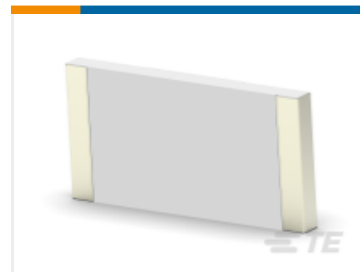
TE Part #4-2176246-5 CRGS2512 5% 4K7