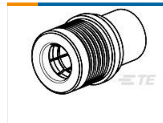
TE Part #619271-1 QMA Plug terminator