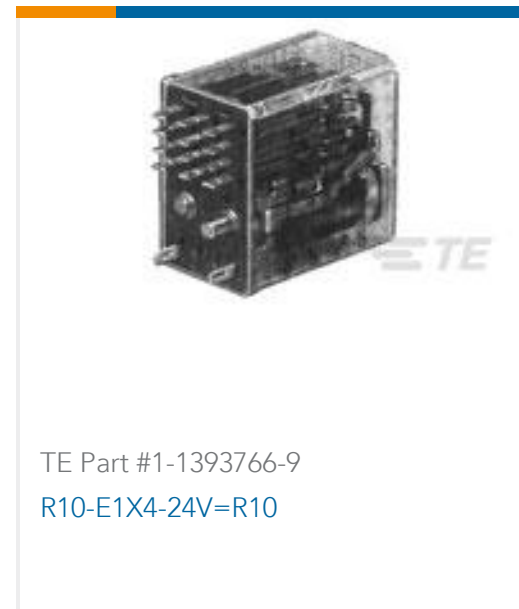
TE Part #1-1393766-9 R10-E1X4-24V=R10