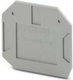
End cover, Length: 63.4 mm, Width: 2.2 mm, Color: gray

Please be informed that the data shown in this PDF Document is generated from our Online Catalog. Please find the complete data in the user's documentation. Our General Terms of Use for Downloads are valid ( http://phoenixcontact.com/download )