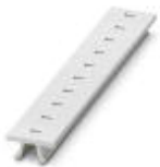
Zack marker strip, Strip, white, labeled, can be labeled with: CMS-P1-PLOTTER, printed horizontally: Identical numbers 1 or 2, etc. up to 100, mounting type: snap into tall marker groove, for terminal block width: 6.2 mm, lettering field size: 6.15 x 10.5 mm

Zack marker strip - ZB 6,LGS:GLEICHE ZAHLEN - 1051032