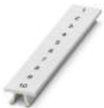
Zack marker strip, Strip, white, labeled, can be labeled with: CMS-P1-PLOTTER, Printed vertically: consecutive numbers 1 - 10, 11 - 20, etc. up to 491 - 500, mounting type: snap into tall marker groove, for terminal block width: 6.2 mm, lettering field size: 6.15 x 10.5 mm

Zack marker strip - ZB 6,QR:FORTL.ZAHLEN - 1051029