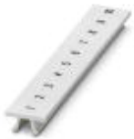
Zack marker strip, Strip, white, labeled, can be labeled with: CMS-P1-PLOTTER, printed horizontally: consecutive numbers 1 - 10, 11 - 20, etc. up to 491 - 500, mounting type: snap into tall marker groove, for terminal block width: 6.2 mm, lettering field size: 6.15 x 10.5 mm

Zack marker strip - ZB 6,LGS:FORTL.ZAHLEN - 1051016