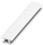
Zack marker strip, can be ordered: Strip, white, labeled according to customer specifications, mounting type: snap into tall marker groove, for terminal block width: 6.2 mm, lettering field size: 6.15 x 10.5 mm

Zack marker strip - ZB 6,LGS:FORTL.ZAHLEN - 1051016