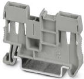
Self-locking flange, width: 5.2 mm, height: 35.3 mm, color: gray, mounting type: NS 35/7,5, NS 35/15

Please be informed that the data shown in this PDF Document is generated from our Online Catalog. Please find the complete data in the user's documentation. Our General Terms of Use for Downloads are valid ( http://phoenixcontact.com/download )