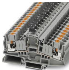
Component terminal block, with integrated P1000Y diode, connection method: Push-in connection, cross section: 0.5 mm 2 - 10 mm 2 , AWG: 20 - 10, width: 8.2 mm, color: gray

Please be informed that the data shown in this PDF Document is generated from our Online Catalog. Please find the complete data in the user's documentation. Our General Terms of Use for Downloads are valid ( http://phoenixcontact.com/download )