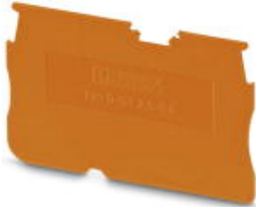
End cover, length: 48.6 mm, width: 0.8 mm, height: 29 mm, color: orange

Please be informed that the data shown in this PDF Document is generated from our Online Catalog. Please find the complete data in the user's documentation. Our General Terms of Use for Downloads are valid ( http://phoenixcontact.com/download )