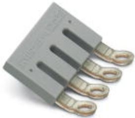
Insertion bridge, pitch: 9 mm, number of positions: 4, color: gray

Please be informed that the data shown in this PDF Document is generated from our Online Catalog. Please find the complete data in the user's documentation. Our General Terms of Use for Downloads are valid ( http://phoenixcontact.com/download )