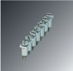
Fixed bridge, number of positions: 7, color: silver

Please be informed that the data shown in this PDF Document is generated from our Online Catalog. Please find the complete data in the user's documentation. Our General Terms of Use for Downloads are valid ( http://phoenixcontact.com/download )