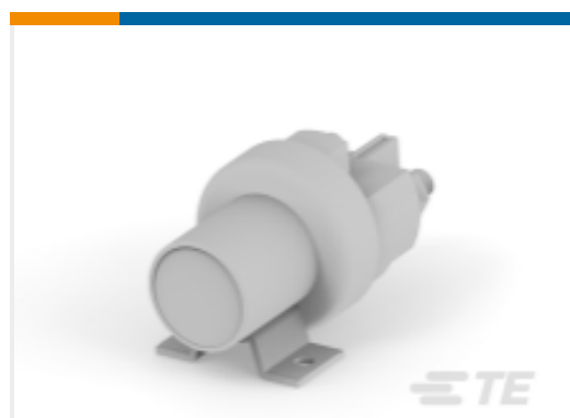
TE Part #K1008699 Relay 26-60-05