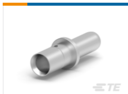
TE Part #SRK-PC-080-25-601 PIN, SOLID, SIZE M8, 25mm2, AG