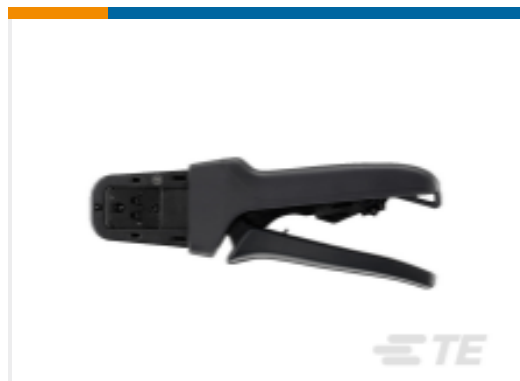
TE Part #DTT-20-03 CRIMP TOOL