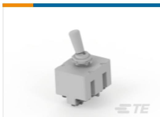
TE Part #K1002956 Toggle Switch 08-4-1-13