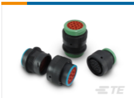
TE Part #HDP24-24-16SE-L015 DEUTSCH HDP20 Housings