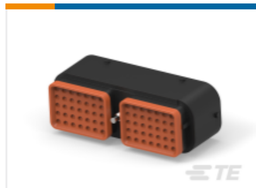
TE Part #DRC16-70SBE-P013UK PLG, 70P, BLK, E, SEAL BOND, B