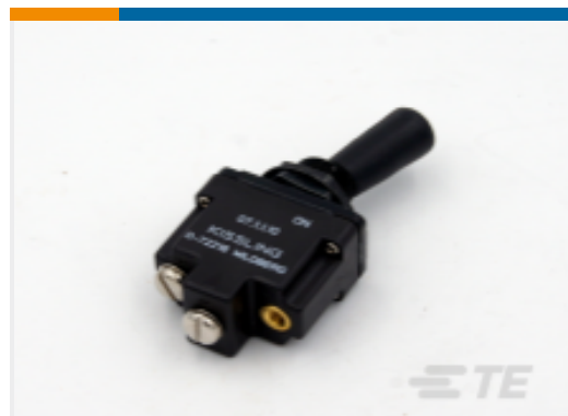
TE Part #K1007153 Toggle Switch 08-1-1-13