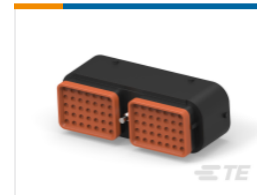
TE Part #DRC16-70SBE-P013UK PLG, 70P, BLK, E, SEAL BOND, B