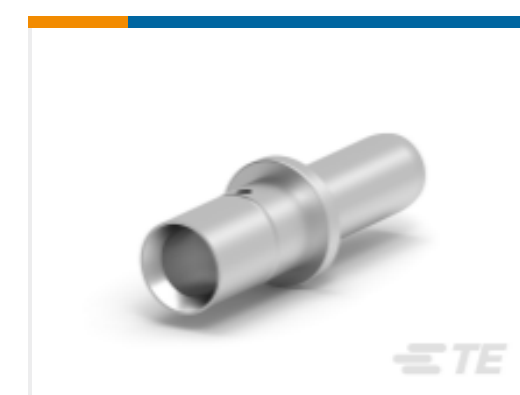
TE Part #SRK-PC-080-25-601 PIN, SOLID, SIZE M8, 25mm2, AG