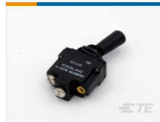
TE Part #K1007153 Toggle Switch 08-1-1-13