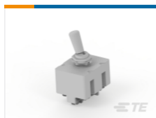
TE Part #K1002956 Toggle Switch 08-4-1-13