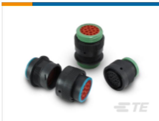
TE Part #HDP24-24-16SE-L015 DEUTSCH HDP20 Housings