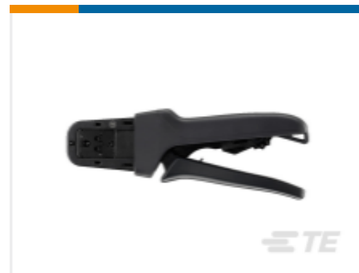
TE Part #DTT-20-03 CRIMP TOOL