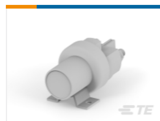
TE Part #K1008699 Relay 26-60-05