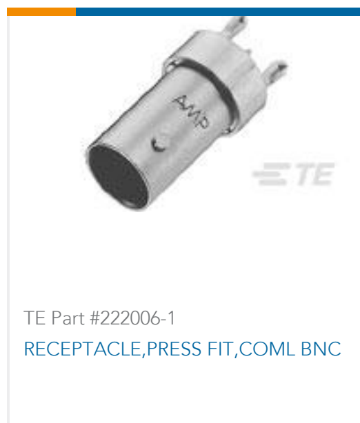
TE Part #222006-1 RECEPTACLE, PRESS FIT, COML BNC