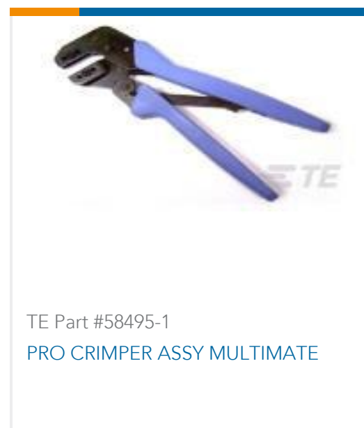
TE Part #58495-1 PRO CRIMPER ASSY MULTIMATE