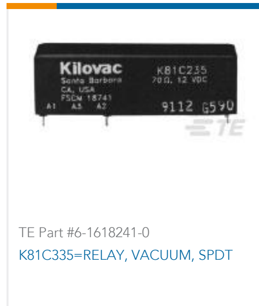
TE Part #6-1618241-0 K81C335=RELAY, VACUUM, SPDT