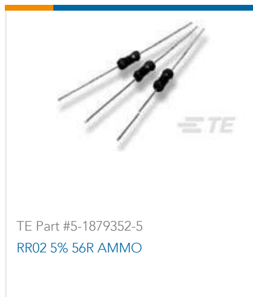
TE Part #5-1879352-5 RR02 5% 56R AMMO