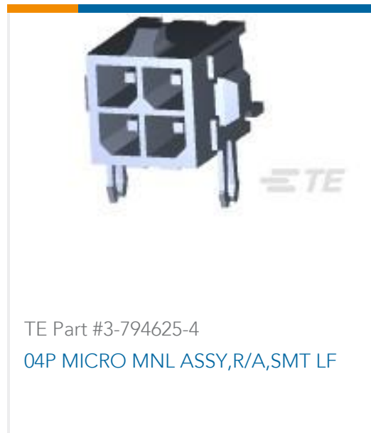
TE Part #3-794625-4 04P MICRO MNL ASSY, R/A, SMT LF