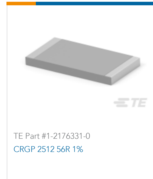
TE Part #1-2176331-0 CRGP 2512 56R 1%