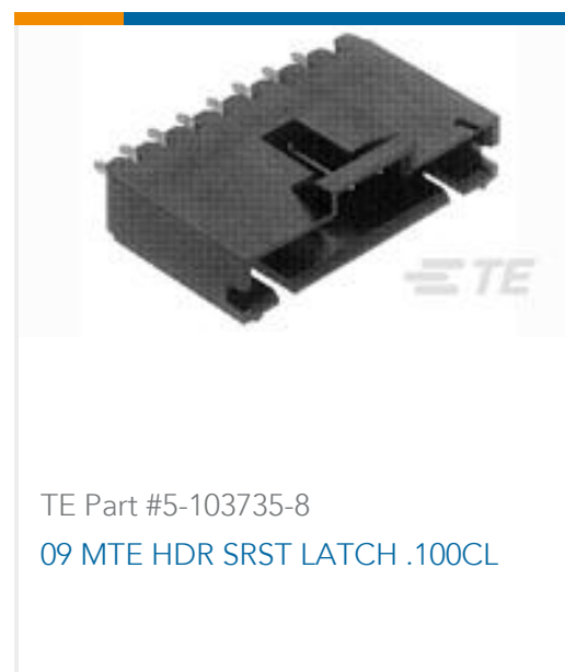
TE Part #5-103735-8 09 MTE HDR SRST LATCH .100CL