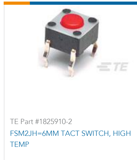
TE Part #1825910-2 FSM2JH=6MM TACT SWITCH, HIGH TEMP