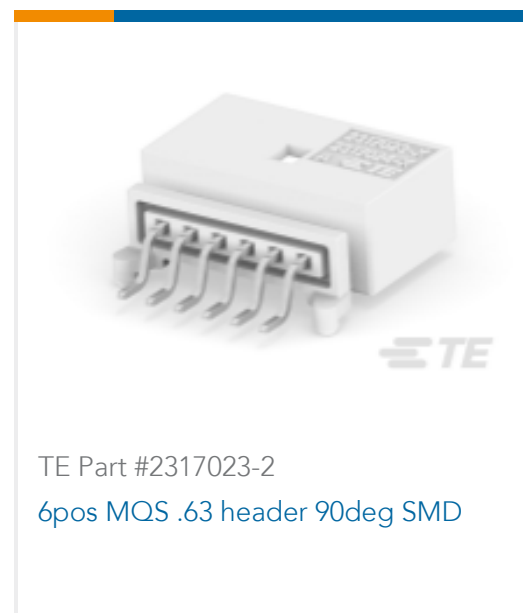
TE Part #2317023-2 6pos MQS .63 header 90deg SMD