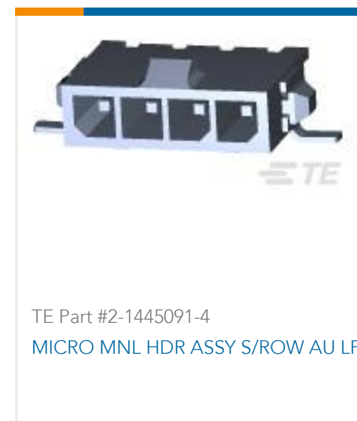
TE Part #2-1445091-4 MICRO MNL HDR ASSY S/ROW AU LF