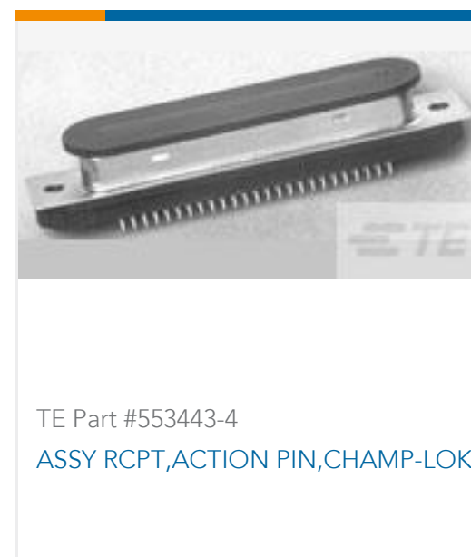
TE Part #553443-4 ASSY RCPT, ACTION PIN, CHAMP-LOK