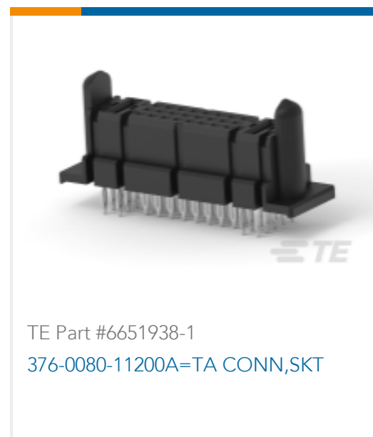
TE Part #6651938-1 376-0080-11200A=TA CONN, SKT