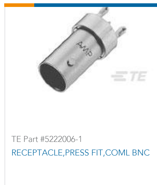
TE Part #5222006-1 RECEPTACLE, PRESS FIT, COMPL BNC