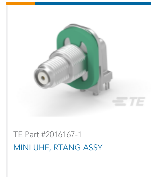
TE Part #2016167-1 MINI UHF, RTANG ASSY