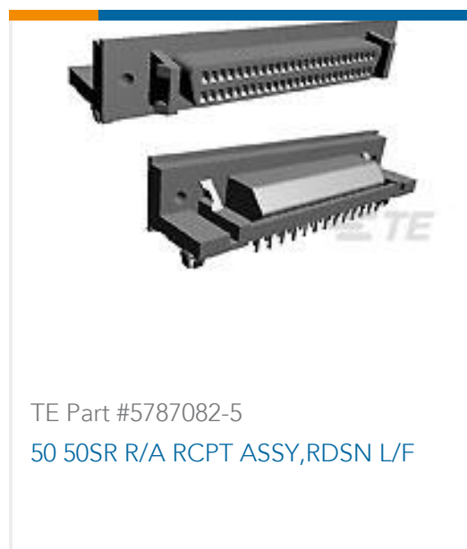
TE Part #5787082-5 50 50SR R/A RCPT ASSY, RDSN L/F