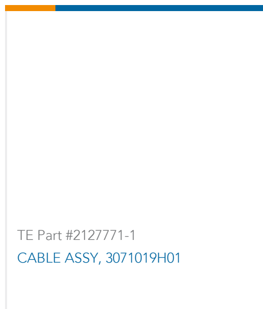
TE Part #2127771-1 CABLE ASSY, 3071019H01