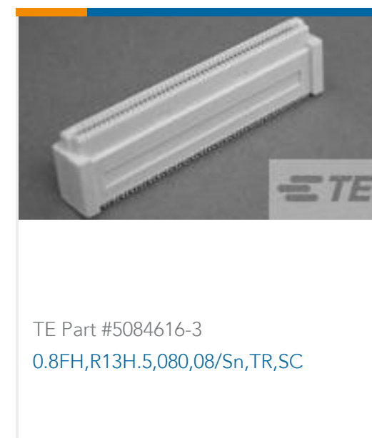
TE Part #5084616-3 0.8FH, R13H.5, 080, 08/Sn, TR, SC