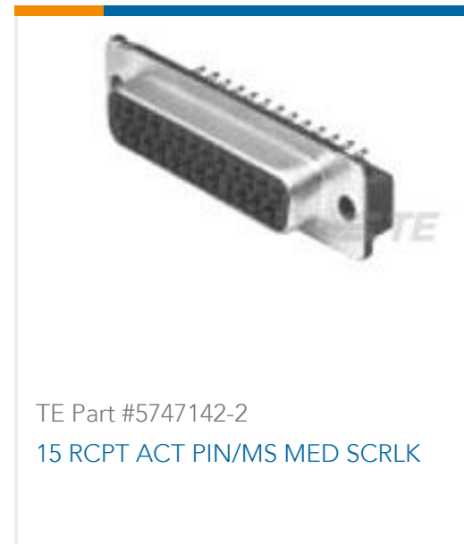
TE Part #5747142-2 15 RCPT ACT PIN/MS MED SCRLK