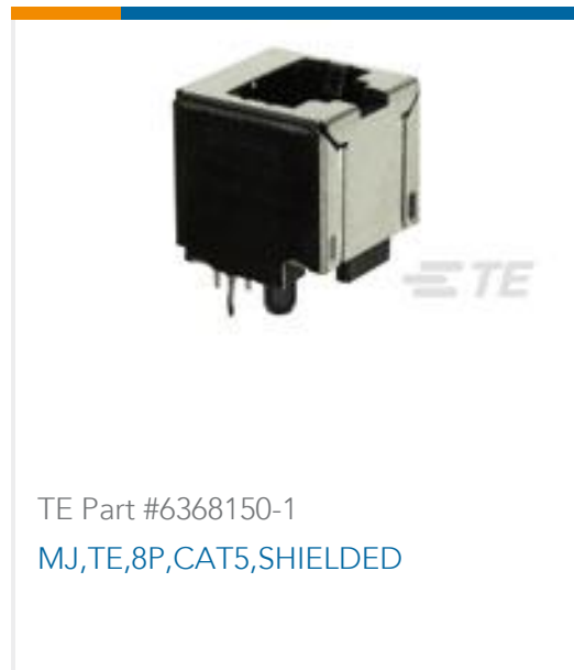
TE Part #6368150-1 MJ, TE, 8P, CAT5, SHIELDED