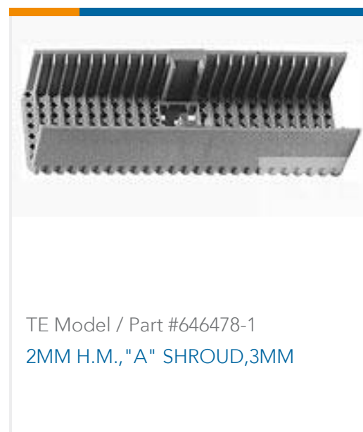
TE Model / Part #646478-1 2MM H.M., "A" SHROUD,3MM