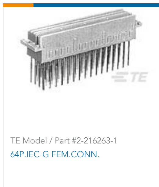
TE Model / Part #2-216263-1 64P.IEC-G FEM.CONN.