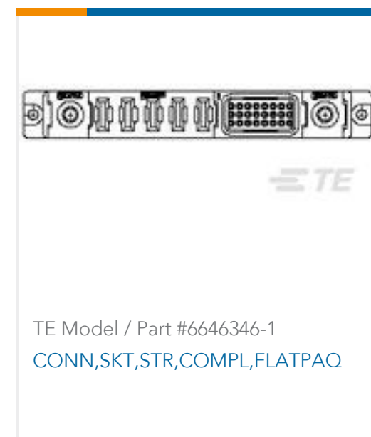
TE Model / Part #6646346-1 CONN,SKT,STR,COMPL,FLATPAQ