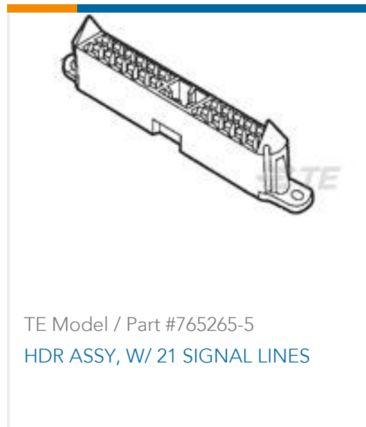
TE Model / Part #765265-5 HDR ASSY, W/ 21 SIGNAL LINES