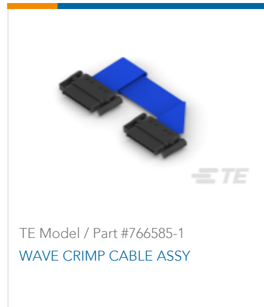
TE Model / Part #766585-1 WAVE CRIMP CABLE ASSY