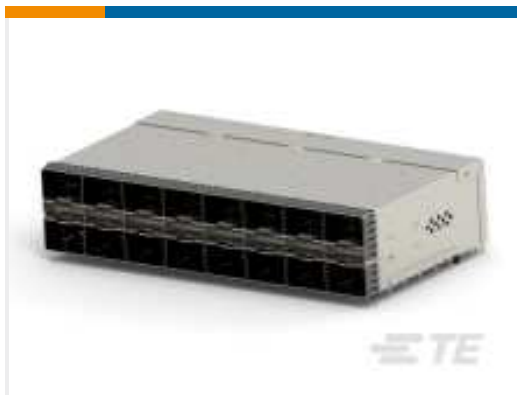
TE Part #3-2340033-1 SFP56 STACKED 2X8 RECEPTACLE ASSEMBLY