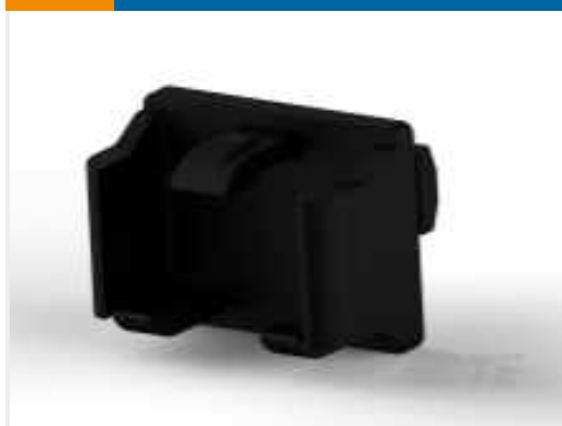
TE Part # 1761394-1 DUST COVER, SFP, GANGED & STACKED