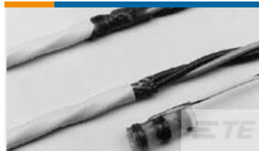
TE Part #866259N005 S02-08-RCS453