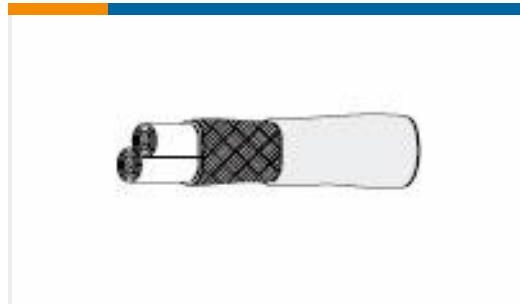
TE Part #596241-000 55A1821-12-9/96-9CS2275