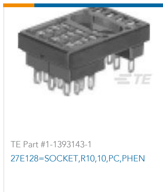
TE Part #1-1393143-1 27E128=SOCKET,R10,10,PC,PHEN