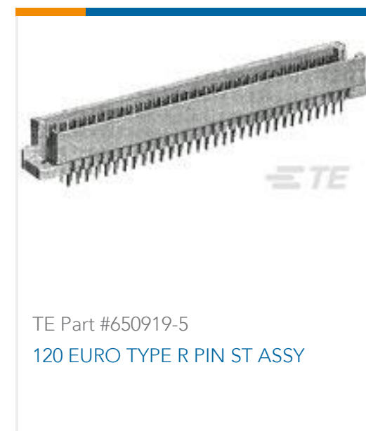
TE Part #650919-5 120 EURO TYPE R PIN ST ASSY