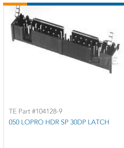
TE Part #104128-9 050 LOPRO HDR SP 30DP LATCH