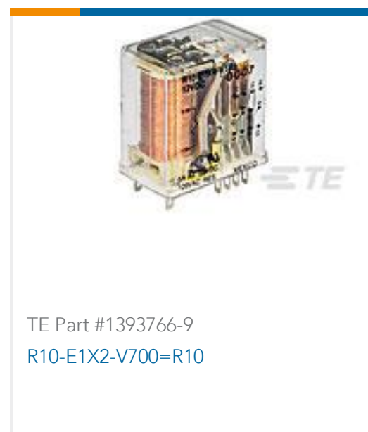
TE Part #1393766-9 R10-E1X2-V700=R10