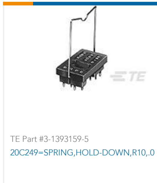
TE Part #3-1393159-5 20C249=SPRING,HOLD-DOWN,R10,0