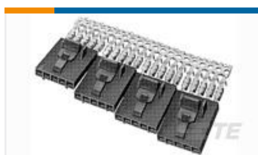
TE Part #5-103956-5 4X6 MTE RCPT SR LATCH .100CL