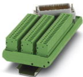
Interface module; connection 1: Screw connection; connection 2: 1x ELCO connector (56-position) (Pin strip, Type 8016, right)

Please be informed that the data shown in this PDF Document is generated from our Online Catalog. Please find the complete data in the user's documentation. Our General Terms of Use for Downloads are valid ( http://phoenixcontact.com/download )