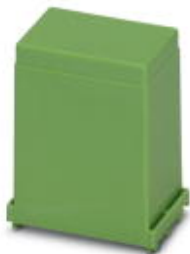
Covering hood, for the contact and dust-protected encapsulation of the components, in green design. Height: 52 mm, width: 30 mm

Please be informed that the data shown in this PDF Document is generated from our Online Catalog. Please find the complete data in the user's documentation. Our General Terms of Use for Downloads are valid ( http://phoenixcontact.com/download )