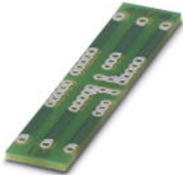
PCB for assembling electronic components

Please be informed that the data shown in this PDF Document is generated from our Online Catalog. Please find the complete data in the user's documentation. Our General Terms of Use for Downloads are valid ( http://phoenixcontact.com/download )