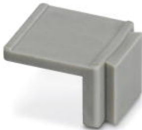
Equipment marker, narrow

Please be informed that the data shown in this PDF Document is generated from our Online Catalog. Please find the complete data in the user's documentation. Our General Terms of Use for Downloads are valid ( http://phoenixcontact.com/download )