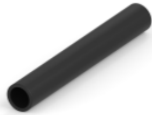
TE Part #CX1369-000 BSTS/BSTS-FR Heat Shrink Tubing