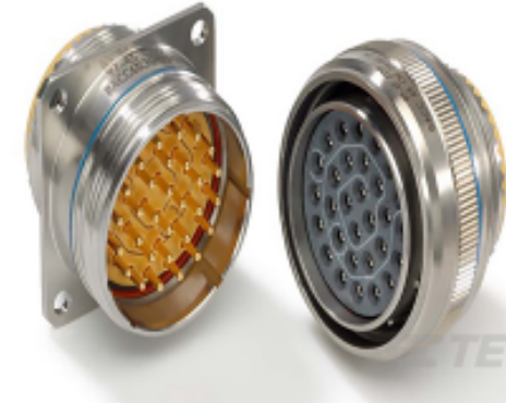
TE Part #ZPF000000000007174 983-ORS 08-98 PN