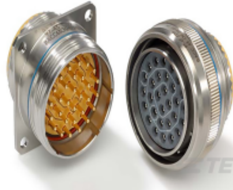
TE Part #358279-000 382C312-50-01-0