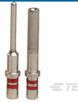
TE Part #ZPF000000000001261 097-0267-16 A1267