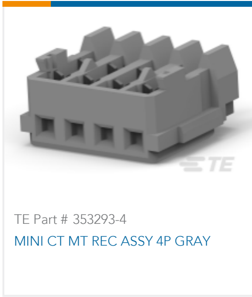
TE Part # 353293-4 MINI CT MT REC ASSY 4P GRAY