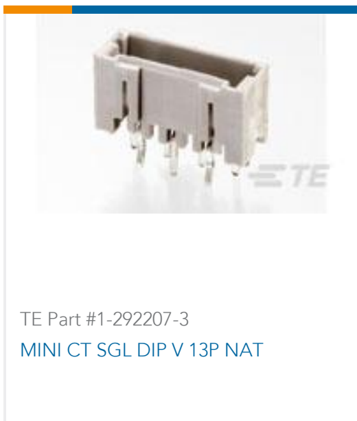
TE Part #1-292207-3 MINI CT SGL DIP V 13P NAT