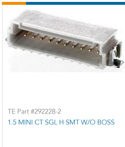
TE Part #292228-2 1.5 MINI CT SGL H SMT W/O BOSS