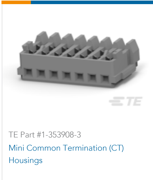
TE Part #1-353908-3 Mini Common Termination (CT) Housings