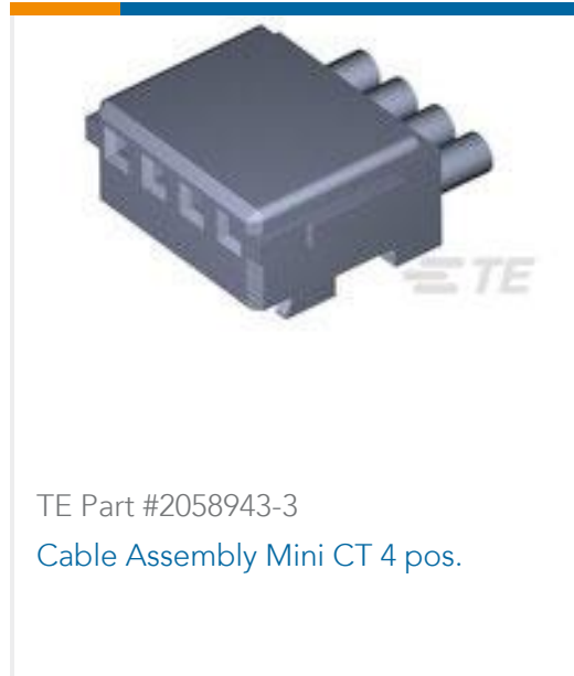
TE Part #2058943-3 Cable Assembly Mini CT 4 pos.