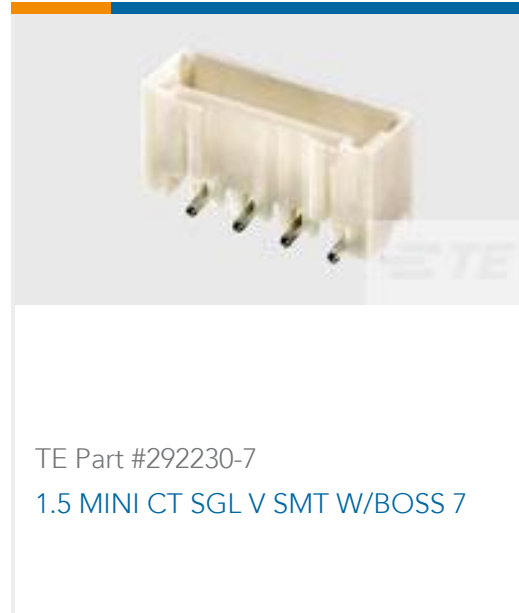
TE Part #292230-7 1.5 MINI CT SGL V SMT W/BOSS 7