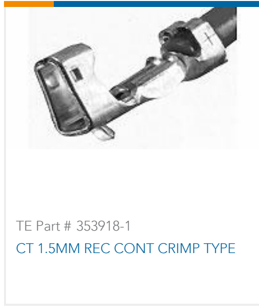
TE Part # 353918-1 CT 1.5MM REC CONT CRIMP TYPE