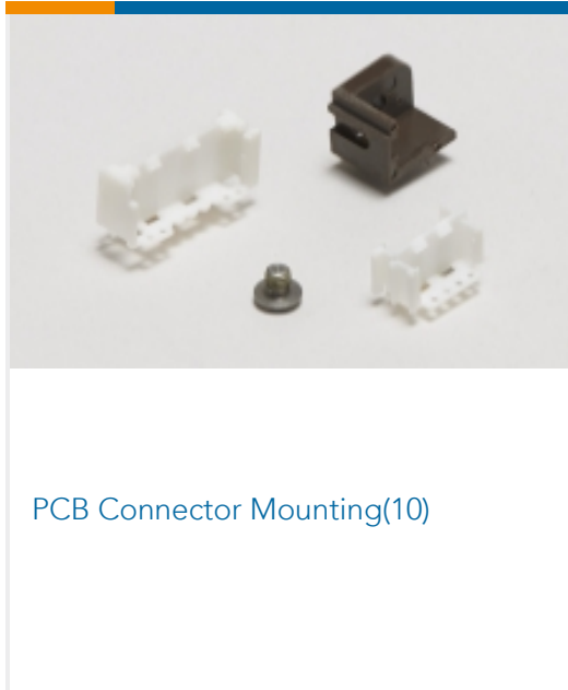
PCB Connector Mounting(10)