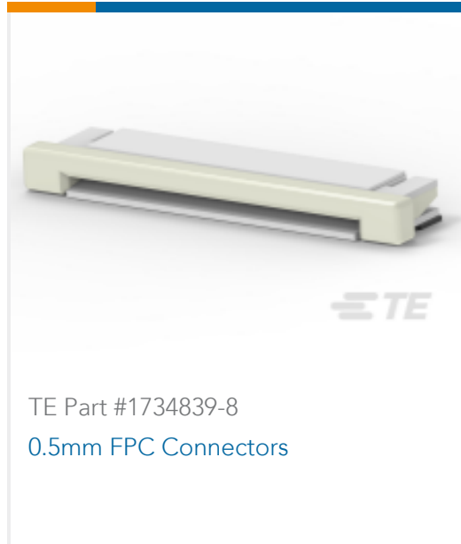
TE Part #1734839-8 0.5mm FPC Connectors