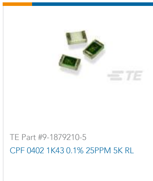
TE Part #9-1879210-5 CPF 0402 1K43 0.1% 25PPM 5K RL