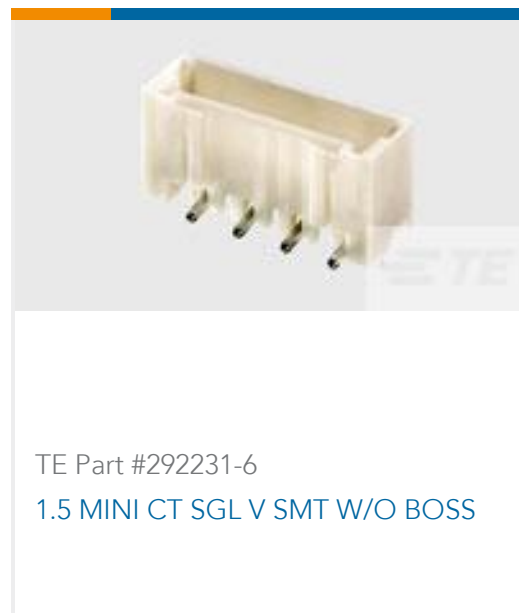
TE Part #292231-6 1.5 MINI CT SGL V SMT W/O BOSS