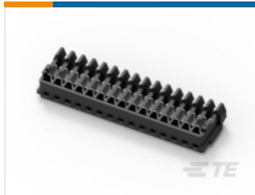
TE Part #3-353293-5 1.5MM CT MT REC ASSY 15P BLACK