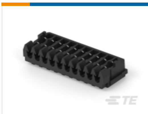
TE Part #3-353293-0 1.5MM CT MT REC ASSY 10P BLACK