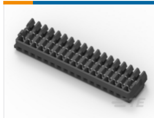
TE Part #3-353293-7 1.5MM CT MT REC ASSY 17P BLACK