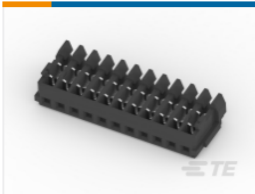
TE Part #3-353293-1 1.5MM CT MT REC ASSY 11P BLACK