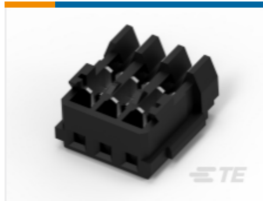
TE Part #2-353293-3 1.5MM CT MT REC ASS'Y 3P BLACK