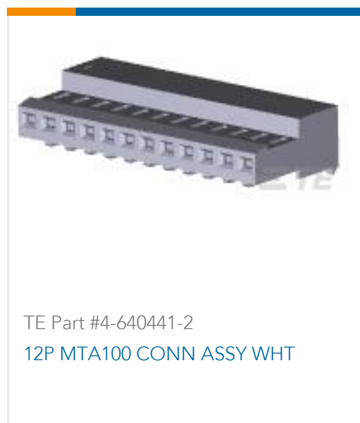
TE Part #4-640441-2 12P MTA100 CONN ASSY WHT