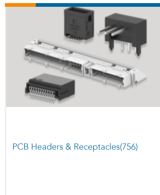
PCB Headers & Receptacles(756)