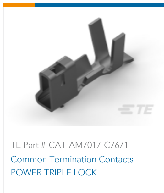
TE Part # CAT-AM7017-C7671 Common Termination Contacts — POWER TRIPLE LOCK