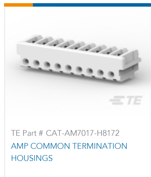
TE Part # CAT-AM7017-H8172 AMP COMMON TERMINATION HOUSINGS