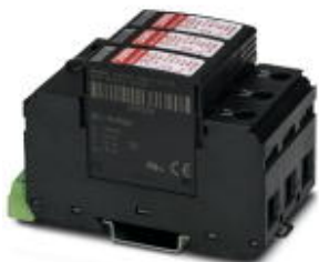
Surge protective device, three channel with remote indicator contact for 347/600V and 400/690 V AC, 4-wire.

Please be informed that the data shown in this PDF Document is generated from our Online Catalog. Please find the complete data in the user's documentation. Our General Terms of Use for Downloads are valid ( http://phoenixcontact.com/download )