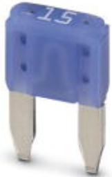
Fuse, nominal current: 15 A, length: 11.9 mm, width: 3.8 mm, height: 16.2 mm

Please be informed that the data shown in this PDF Document is generated from our Online Catalog. Please find the complete data in the user's documentation. Our General Terms of Use for Downloads are valid ( http://phoenixcontact.com/download )