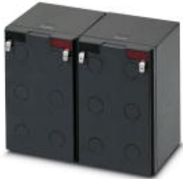
Replacement battery for UPS-BAT/VRLA... power storage

Please be informed that the data shown in this PDF Document is generated from our Online Catalog. Please find the complete data in the user's documentation. Our General Terms of Use for Downloads are valid ( http://phoenixcontact.com/download )