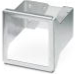
DIN rail adapter for EEM-MA600 and EEM-MA400 energy meters

DIN rail adapter - EEM-MKT-DRA - 2902078