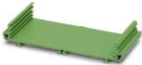
The figure shows the variant UM 45-Profil CM

Panel mounting base, open, Lower part, Cross connection: without bus connector, color: green, width: 1000 mm, number of positions cross connector: not relevant, Note: required profile length = PCB length - 3.6 mm