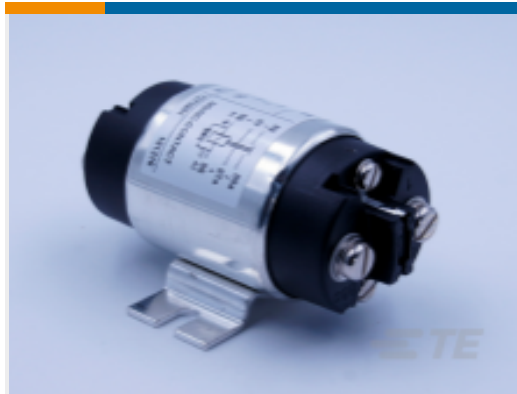
TE Part # CAT-AL6-KSPR2975 Power Relay, 75A, Standard, Monostable, DC