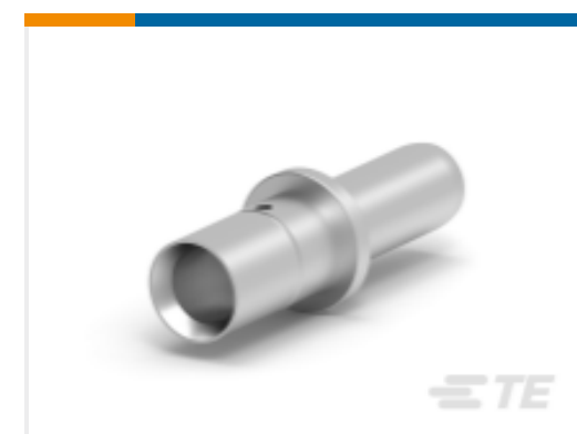
TE Part #SRK-PC-080-25-601 PIN, SOLID, SIZE M8, 25mm2, AG