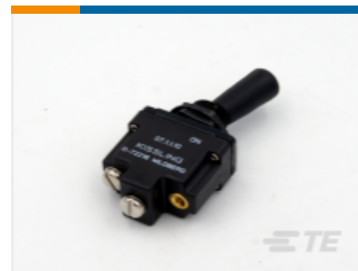
TE Part #K1007153 Toggle Switch 08-1-1-13