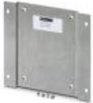
Mounting plate for SFNT switches

Mounting plate - FL PA SFNT 5-8 - 2891012