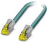
Patch cable, CAT6 A , 4-pair, shielded, connection not crossed (line), assembled at both ends with RJ45/IP20 connectors, outer sheath material: PUR, length: 2.0 m

Patch cable - NBC-R4AC/10G-R4AC/10G-94F/2,0 - 1408360