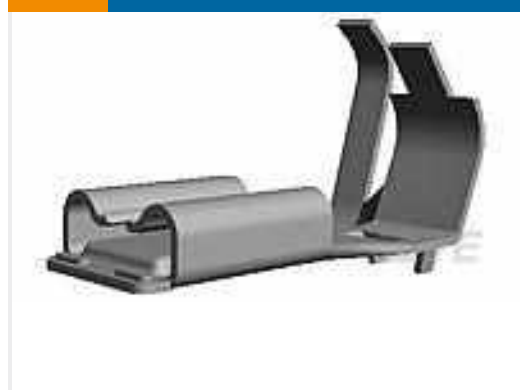
TE Part #175193-1 187 PL EX FLAG REC. 22-16AWG PTBR