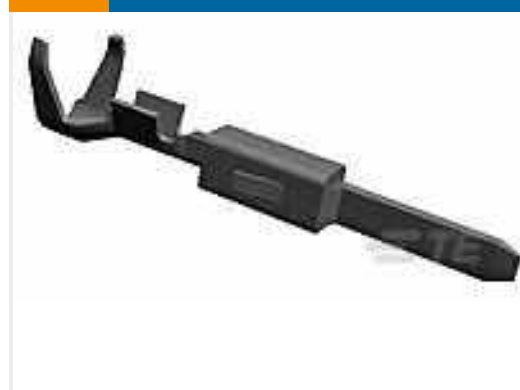
TE Part #1241846-2 TAB A 1.6x0.6 CONTACT CF SRC Sn