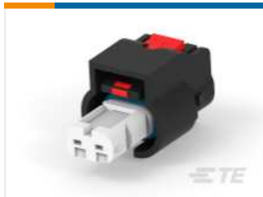
TE Part #1-1924067-5 2POS, MCON 1.2 CB REC 2p TL SEALED