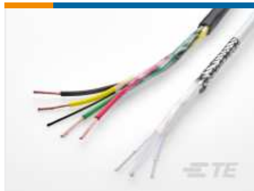
TE Part #102308-000 2020D0309-0