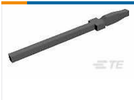
TE Part #8-963964-4 ACTION PIN FOR 1 mm HOLE