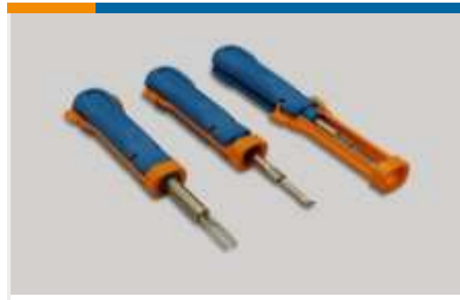
Insertion & Extraction Tools(13)