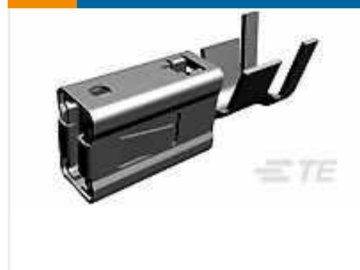
TE Part #1241404-3 AMP MCP 6.3/4.8K, CONTACT