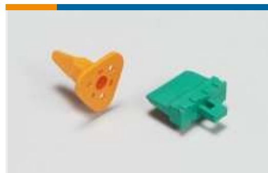
Automotive Connector Locks & Position Assurance(6)