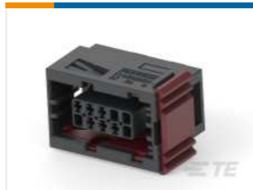
TE Part #6-1355688-7 MT3-REC. HOUSING, 6 POS.