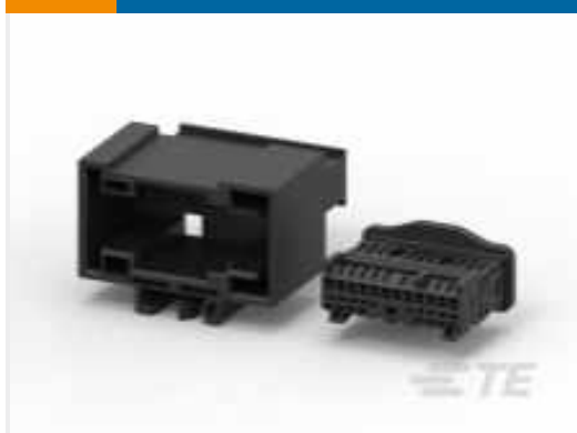
TE Part #1-929170-4 MQS, CONNECTOR HOUSING