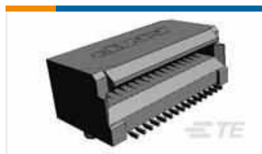
TE Part #1367500-1 30 POSN XFP CONN, ENHANCED