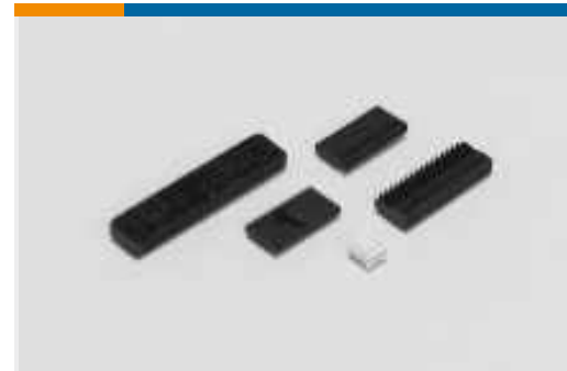
Wire-to-Board Connector Assemblies &amp; Housings(151)