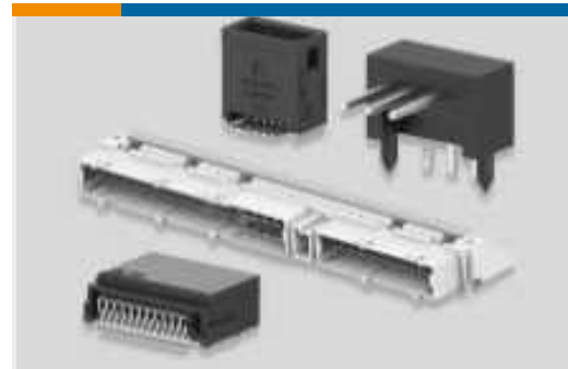
PCB Headers &amp; Receptacles(83)