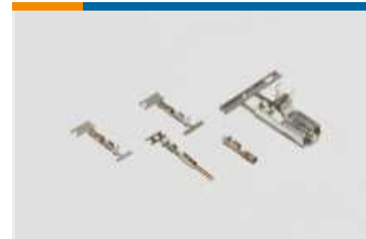
Wire-to-Board Connector Contacts(4)