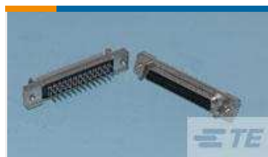
TE Part #5786555-7 68 50SR VRT RCPT,FL TOP,ACT PN