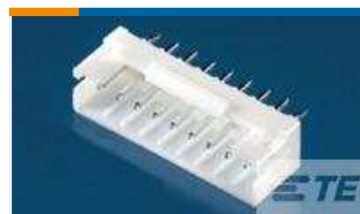
TE Part #1735446-6 2MM PITCH HPI POST HEADER, VERTICAL, 6P