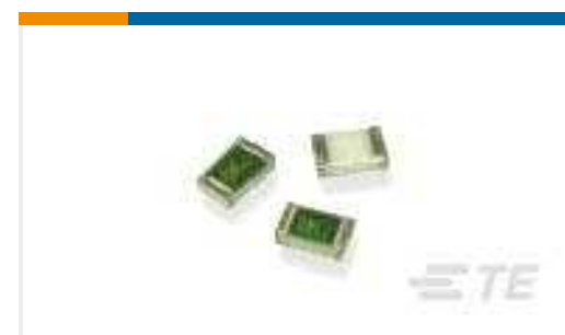
TE Part #1676455-2 RN 0805 8K06 0.1% 10PPM 1KRL