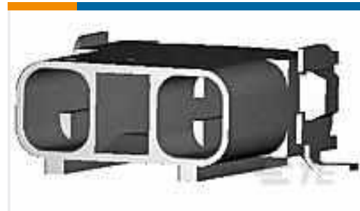
TE Part #2106056-2 Assembly, Right Angle SMT Header, 2-Posi