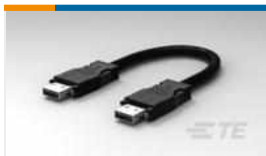
TE Part #2083112-2 CABLE ASSY IND. USB-IND. USB TYPE A