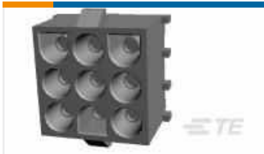
TE Part #350835-4 09P UMNL HDR ASSY PC 94VO LF