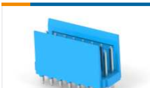
TE Part #281740-2 HE13/HE14 TH Headers, DRST