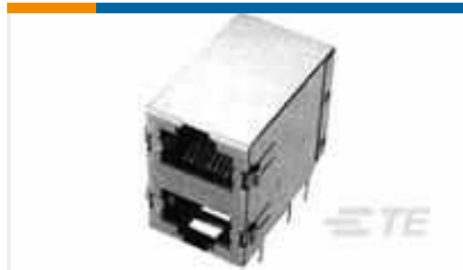
TE Part #5569450-1 STK MJ,8P,2X1,UNSHLD,CAT5