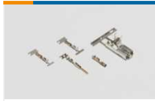
Wire-to-Board Connector Contacts(4)