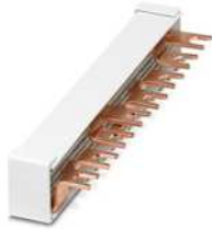
Wiring bridge for modules with connecting pitch 17.5 mm, 4-phase, 8-pos.

Please be informed that the data shown in this PDF document is generated from our Online Catalog. Please find the complete data in the user documentation. Our General Terms of Use for Downloads are valid.