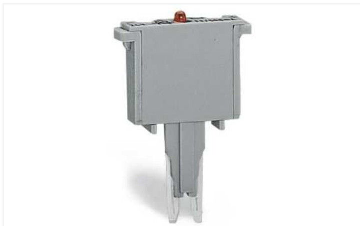
Color: ■ gray