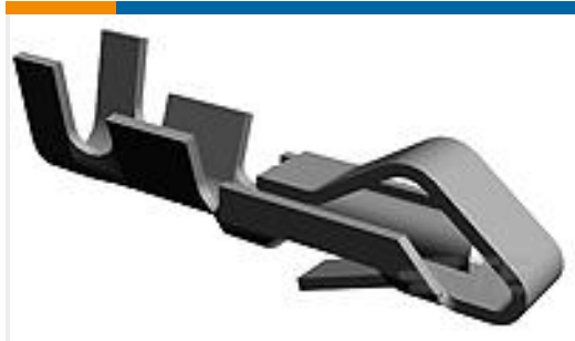
TE Part #640252-2 SL-156 RECEPTACLE