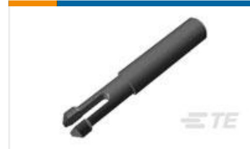
TE Part #1-640415-0 UMNL KEYING PLUG V0