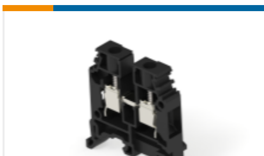
TE Part #1SNA400239R1500 M6/8