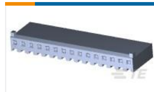
TE Part #1-770849-5 15P SL156 HSG W/LOC RAMP W/TBS