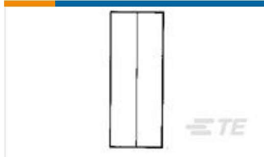
TE Part #36946 SPLICE,SOLIS PARA 1/0