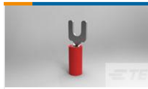
TE Part #2-34541-1 PIDG SPD 22-16 COMM 22-18MIL 6