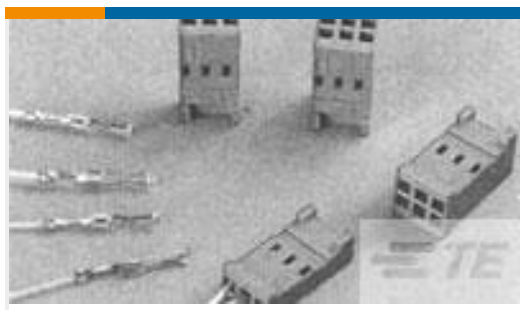
TE Part #281838-8 HOUSING HE13 HE14 COSI 8 P