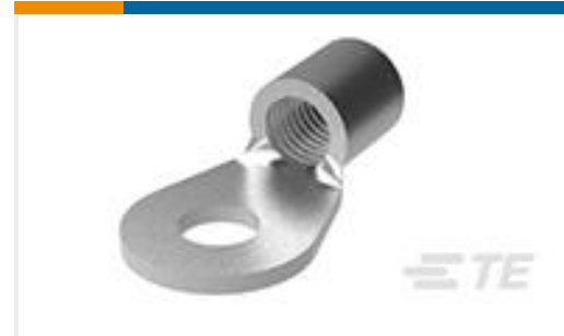
TE Part #33465 TERMINAL,SOLIS R 6 1/4