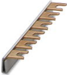
Wiring bridge for modules with connecting pitch 17.5 mm, 1-phase, 12-pos.

Please be informed that the data shown in this PDF Document is generated from our Online Catalog. Please find the complete data in the user's documentation. Our General Terms of Use for Downloads are valid ( http://phoenixcontact.com/download )