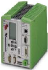
Remote Field Controller with 1x10/100 Ethernet, INTERBUS-Master, IP20 degree of protection, pluggable parameterization memory (MC FLASH)

Please be informed that the data shown in this PDF Document is generated from our Online Catalog. Please find the complete data in the user's documentation. Our General Terms of Use for Downloads are valid ( http://phoenixcontact.com/download )