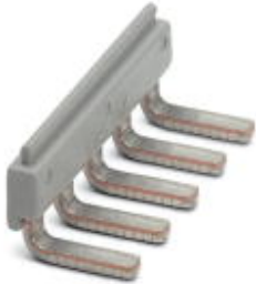
Insertion bridge, number of positions: 5, color: gray

Please be informed that the data shown in this PDF Document is generated from our Online Catalog. Please find the complete data in the user's documentation. Our General Terms of Use for Downloads are valid ( http://phoenixcontact.com/download )