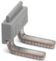
Insertion bridge, number of positions: 2, color: gray

Please be informed that the data shown in this PDF Document is generated from our Online Catalog. Please find the complete data in the user's documentation. Our General Terms of Use for Downloads are valid ( http://phoenixcontact.com/download )