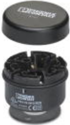
Connection element with screw connection terminal blocks for base mounting

Please be informed that the data shown in this PDF Document is generated from our Online Catalog. Please find the complete data in the user's documentation. Our General Terms of Use for Downloads are valid ( http://phoenixcontact.com/download )