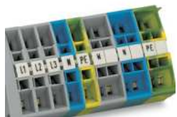
Marking via Mini-WSB Quick Marking System.