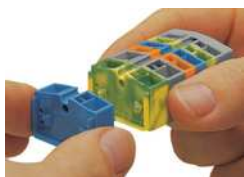
Assembling modular terminal blocks into terminal strips.