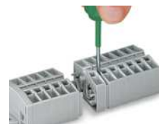
Removing a terminal block.