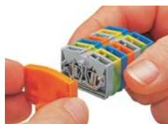
Mounting an end plate.