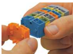
Mounting an "end terminal block" with mounting flange.