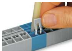
Commoning with comb-style jumper bar.