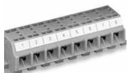
Marking with self-adhesive marking strips.