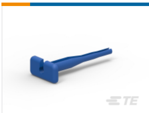
TE Part #0411-310-1605 EXT TOOL, SIZE 16, 16-18 AWG, T, LT BLU