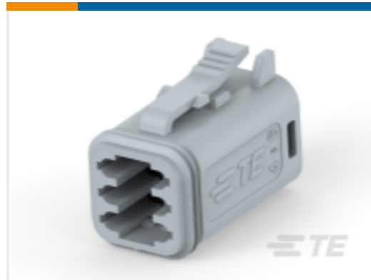
TE Part #2600035-2 6CCT GREY PLUG W/SMALL SEAL