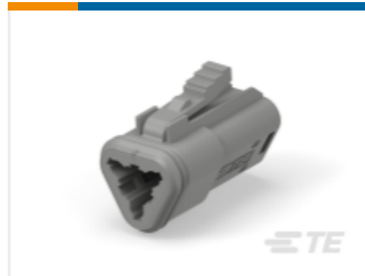
TE Part #2600027-2 3CCT GREY PLUG W/SMALL SEAL