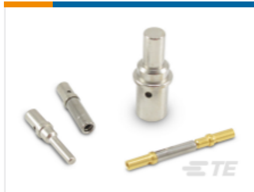
TE Part #0460-215-16141 DEUTSCH Solid Contacts