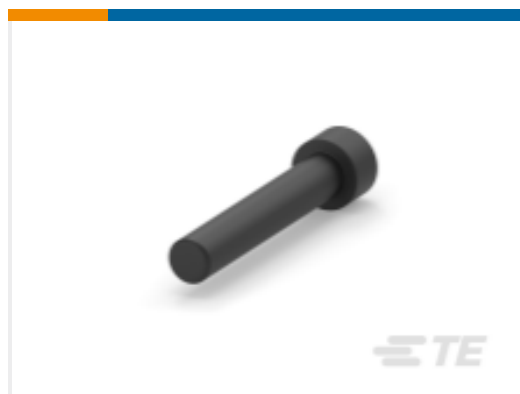
TE Part #2600048-1 BLIND CAVITY PLUG