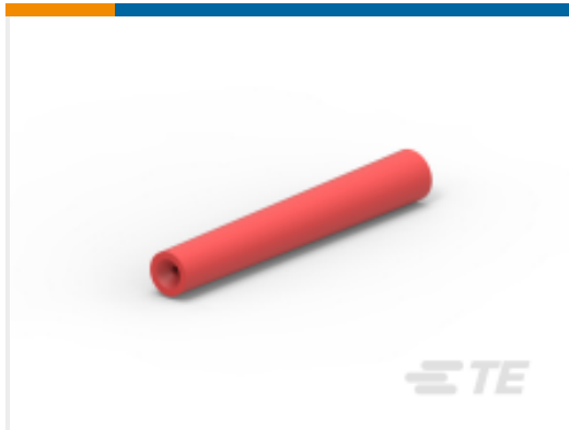
TE Part #JS-16-00 JIFFY SPLICE, Size 16