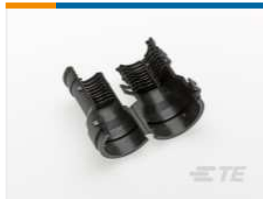
TE Part # 2600004-1 PANEL GASKET FOR XRC SHELL 18