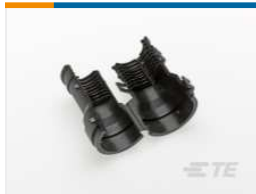
TE Part # 2600002-1 SHELL 18 RECEPTACLE JAM NUT