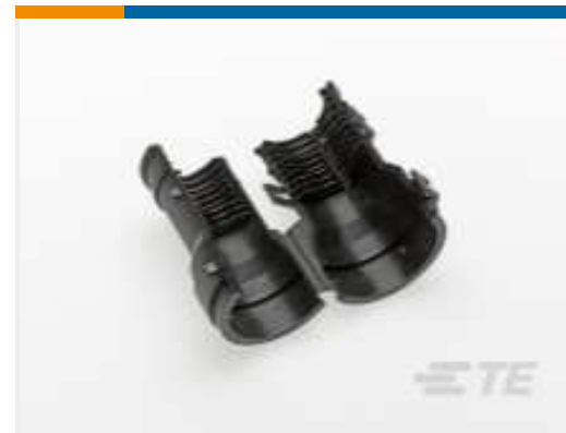
TE Part # 2600019-1 SIZE 16 CAVITY PLUG XRC