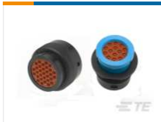
TE Part # 2600005-1 SHELL 18-14CKT PLG W/SOCKET BL W/LIP XRC