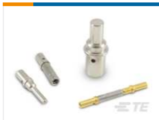
TE Part #0460-202-16141 DEUTSCH Solid Contacts