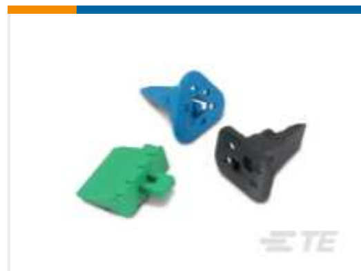
TE Part #W2S DEUTSCH DT Wedgelocks